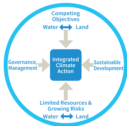
Figure 7-3 Approach on integrated climate action in the water-land nexus

Figure 7-3 demonstrates an approach to understand integrated climate action in the water-land nexus, which includes key drivers ( e.g. sustainable development and cross-sectoral governance/management) and challenges ( e.g. competing objectives, limited resources, and growing risks).